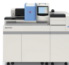
AIA-900 with 9 Tray Sorter Also available with 19 tray sorter option and as Loader model